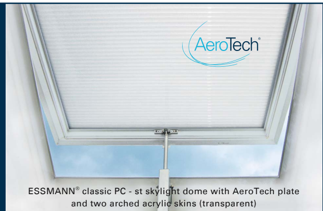
ESSMANN® classic PC - st skylight dome with AeroTech plate and two arched acrylic skins (transparent)

The ESSMANN classic PC - st skylight dome enhances the range of ESSMANN skylight dome products for applications with stringent heat insulation requirements. This skylight dome already meets the requirements of the future.